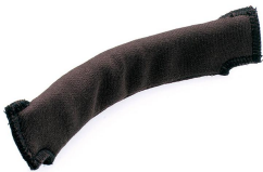
Optimatic / Hellmet Sweat band