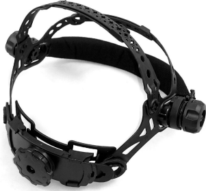
HEAD GEAR HELLMET