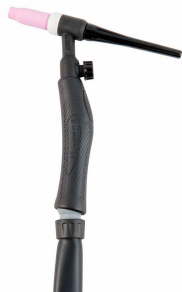
ANTORCHA 4M TIG SR17V